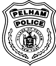
VILLAGE OF PELHAM 34 FIFTH AVENUE - TOWN HALL PELHAM, NEW YORK 10803